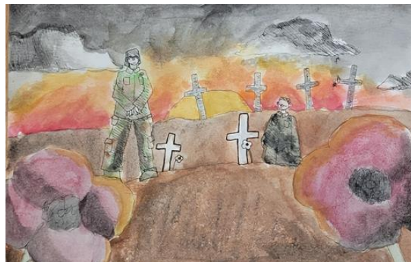
Eileen Flanagan Gr 6 Notre Dame Catholic Elementary School